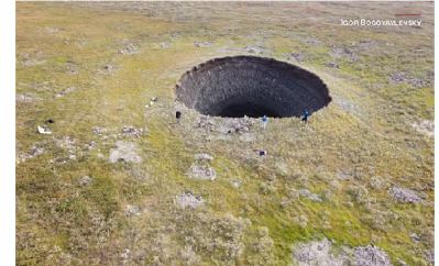
7,000 exploding methane holes in Siberia linked to climate change