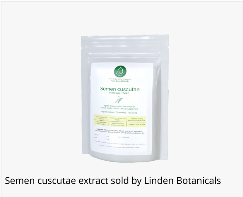
Semen cuscatae extract sold by Linden Botanicals

This press release can be viewed online at: https://www.einpresswire.com/article/552610981