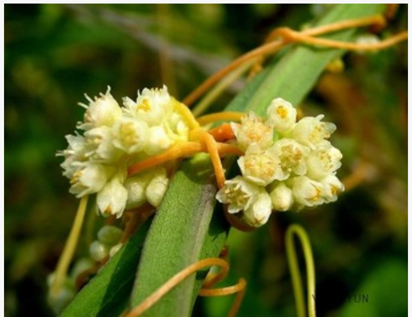
Semen cuscutae - Tu Si Zi - Linden Botanicals

Semen cuscutae extract may invigorate the male reproductive system and endocrine function.