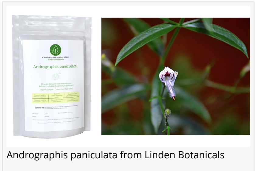
Andrographis paniculata from Linden Botanicals

experimental evidence in favor of Andrographis paniculata and its major bioactive component, andrographolide, for further investigation as a possible monotherapy or in combination with other effective drugs against SARS-CoV-2 infection.