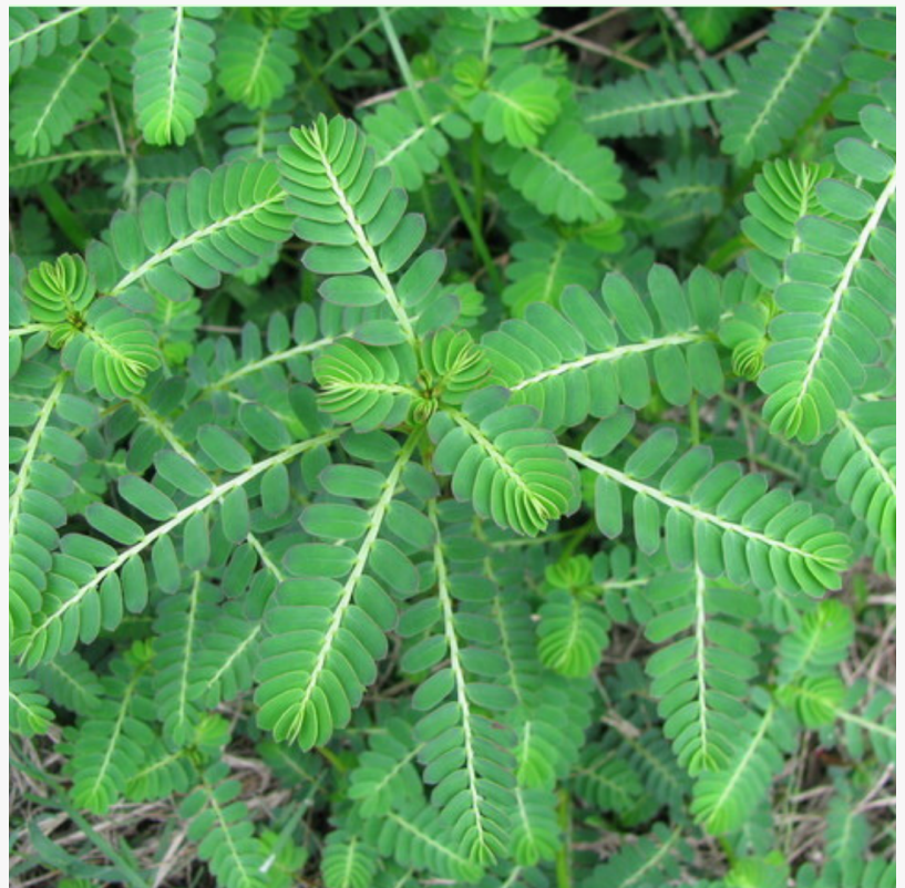
Linden Botanicals Phyllanthus niruri (Chanca Piedra) Tea

Phytochemical studies on Phyllanthus niruri from as early as 1861 have shown that the plant is rich in tannins, flavonoids, alkaloids, terpenes, coumarins, lignans, and phenylpropanoids, which are responsible for its pharmacological activity, including its potential ability to provide liver disease herbal support and antiviral support.