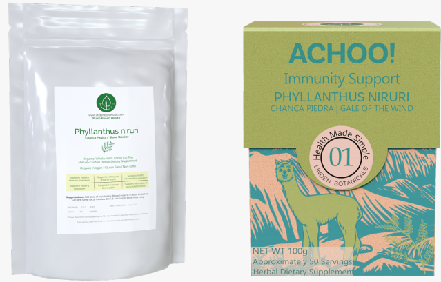
Phyllanthus niruri and ACHOO! Immune Health Support from Linden Botanicals