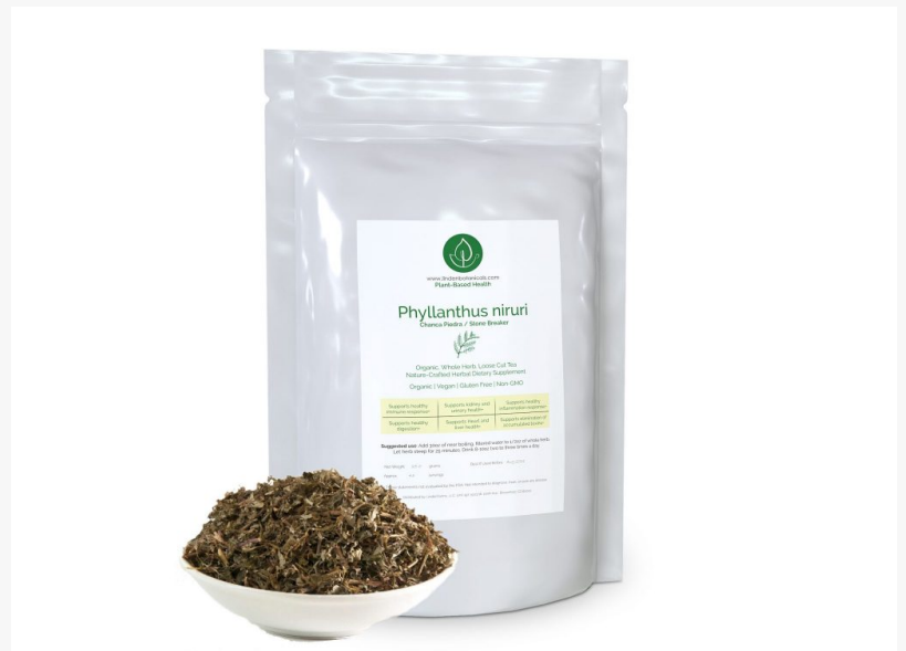
Linden Botanicals Phyllanthus niruri Herbal Looseleaf Tea