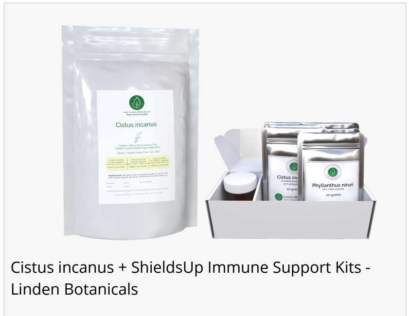
Cistus incanus + ShieldsUp Immune Support Kits - Linden Botanicals

-- Cistus incanus tea offers significant immune support and scientifically proven relief of cold and flu symptoms. Phyllanthus niruri tea is an antiviral, antimalarial, and antibacterial that may help balance the immune system. Linden Botanicals is the only store in the world that sells both Mediterranean Cistus incanus (Rock Rose) herbal loose-leaf tea from Crete and Phyllanthus niruri (Chanca Piedra) herbal loose-leaf tea from the Amazon region.