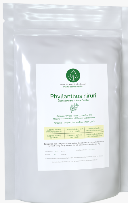
Phyllanthus niruri Tea and Extract from Linden Botanicals