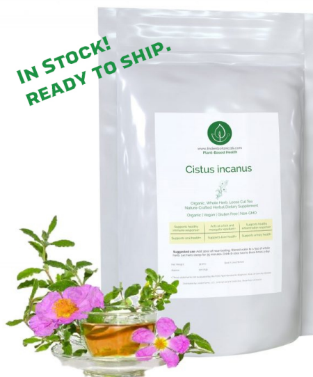
Mediterranean Cistus incanus Tea (Rock Rose Tea) from Linden Botanicals