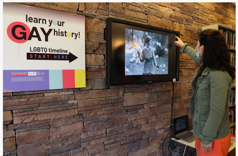
In Plain Sight - LGBTQ History Timeliness by Stonewall #2