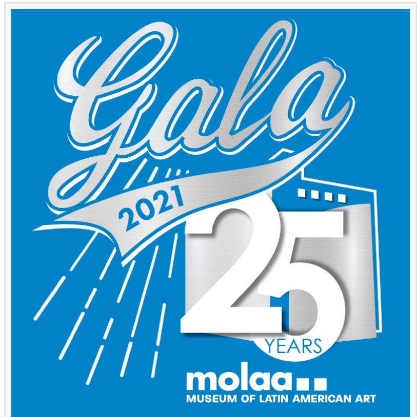
2021 MOLAA Gala Logo

MOLAA thanks and recognizes the support of the sponsors who have joined the celebration of the Gala: AltaMed and Robert Gumbiner Foundation - Diamond Sponsors; Hyundai Motor of America and The Boeing Company – Platinum Sponsors; Bank of America – Gold Sponsor; Port of