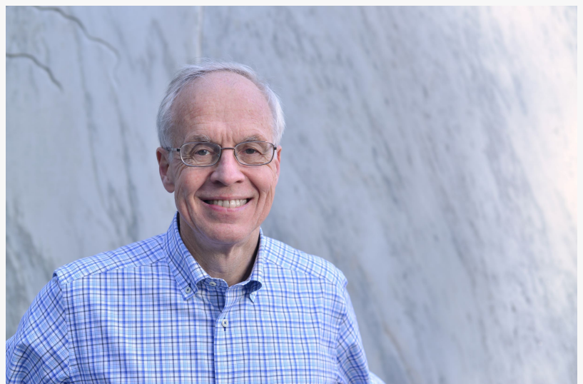
Dr. Bud Pierce, Republican Candidate for Oregon Governor in front of the Capitol Building