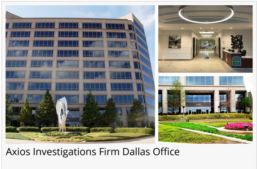
Axios Investigations Firm Dallas Office