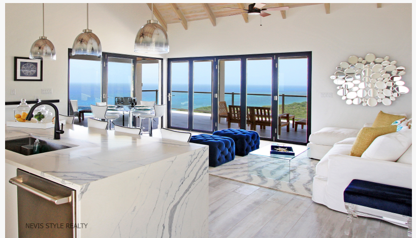
Blue Serenity - Luxury Villa on St. Kitts and Nevis