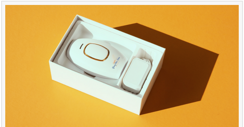
At-Home Hair Removal

use the product. At first, I was a bit nervous about using it on my body, but then I tried it, and it worked perfectly. I set it at maximum intensity, and it helped to remove hair on the entire leg fast, without any pain or dark spots. I will repurchase it if I have to and also recommend it to others."