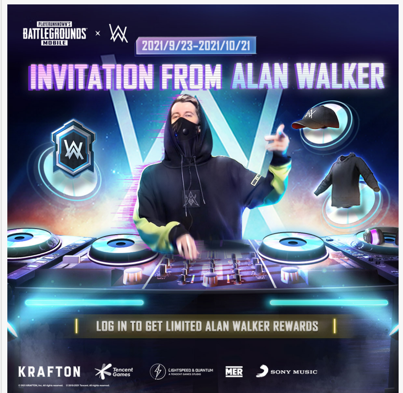
PUBG MOBILE X Alan Walker, Paradise