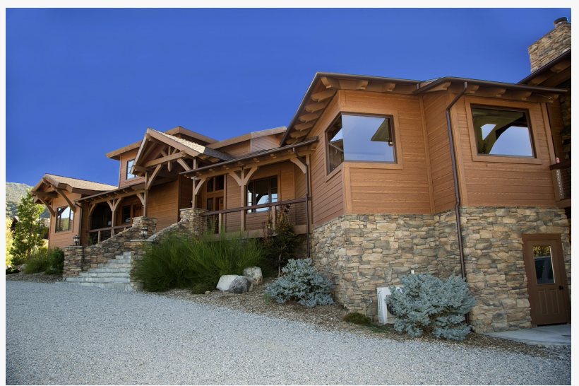
Mountain Cedar Allura - James Hardie

GS Exterior Experts provides multiple James Hardie sidings and panels that reduce the wear and tear caused by weather and other natural occurrences such as wildfires. If Colorado homeowners do not take the necessary steps to protect their homes, their safe havens will be destroyed. The best way to mitigate the potential consequences of such disasters is to install James Hardie sidings and use non-combustible material. Another way to minimize the impact and compensate for the damage is by taking out home insurance , which will