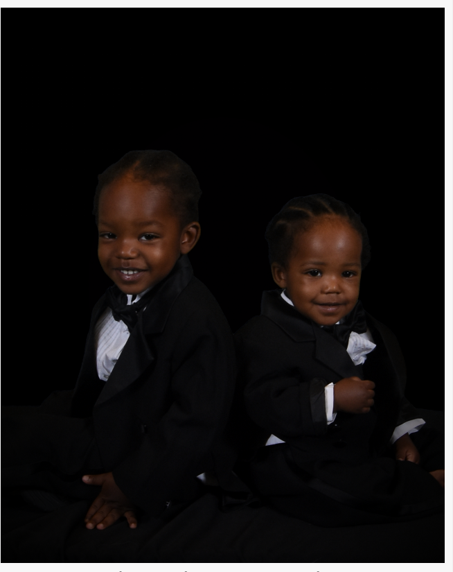
Loving Brothers Champion and Dominion

Kisses From the Mrs. PR Kisses From the Mrs. +1 678-379-3195 biz@elizabethclyde.com