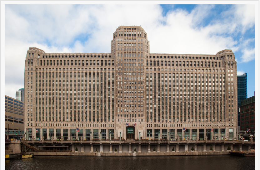
The Merchandise Mart

CHICAGO, IL, USA, October 2, 2021 /EINPresswire.com/ -- Formaspace executives announced the debut of its new permanent furniture showroom on the 11th floor of the Chicago Merchandise Mart (Suite 11-124), which will open its doors on October 4, 2021, as part of the NeoCon 2021 international furniture exposition.