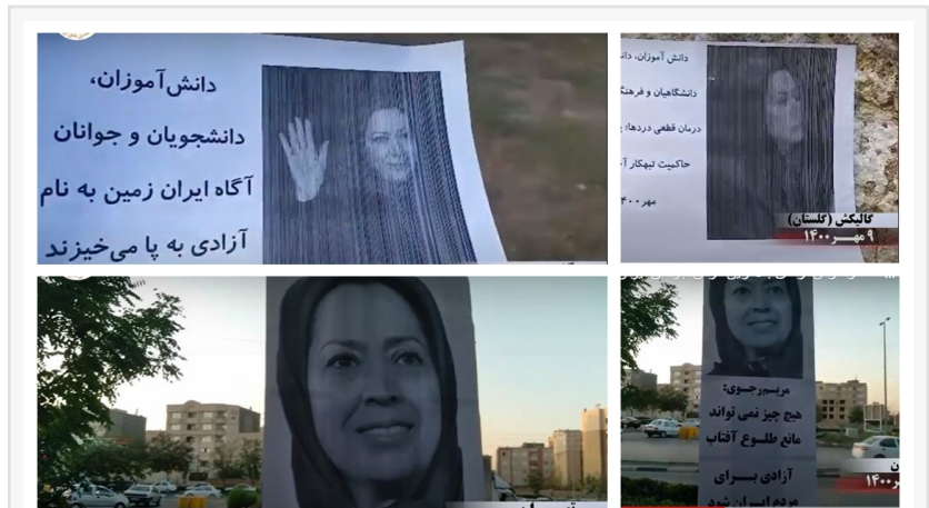
(PMOI / MEK Iran) and (NCRI): Galikesh (Golestan) - “To the students & teachers, the only solution to put an end to problems is to overthrow the mullahs’ regime”. Tehran - “Nothing can prevent the sunrise of freedom from shining”.

The information presented above represents only a small part of Iran’s current societal problems. This administration is causing pain to the people. The public’s animosity toward the