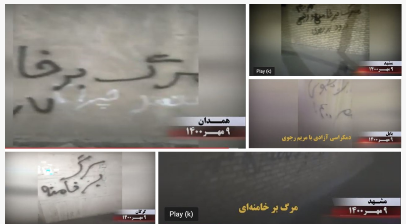
(PMOI / MEK Iran) and (NCRI): Hamadan - “Down with Khamenei”. Mashhad - “Down with Khamenei & Raisi, hail to Rajavi”. Babol - “Democracy & freedom with Maryam Rajavi”. Gorgan - “Down with Khamenei”.

As a result, they should devote the majority of their