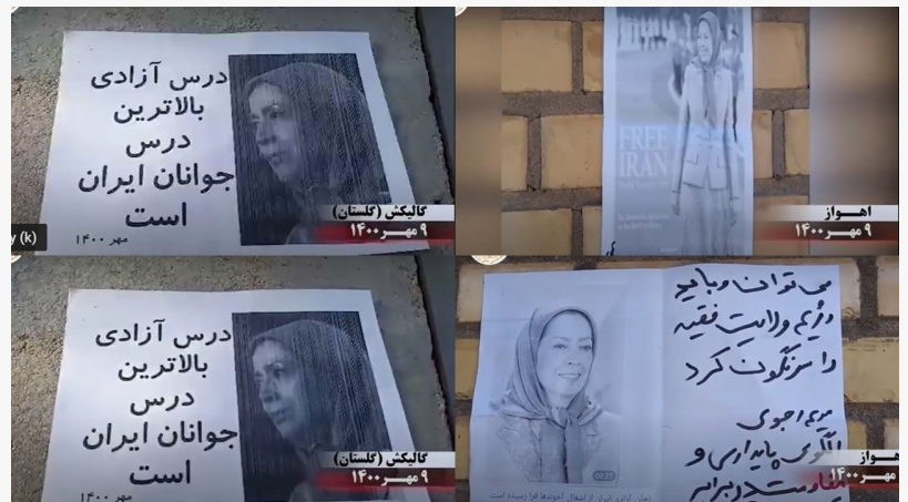
(PMOI / MEK Iran) and (NCRI): Galikesh (Golestan) - “The Iranian youth have learned the lesson of freedom”. Ahvaz - “We can and we must”. “National solidarity, equality, and justice with Maryam Rajavi”.