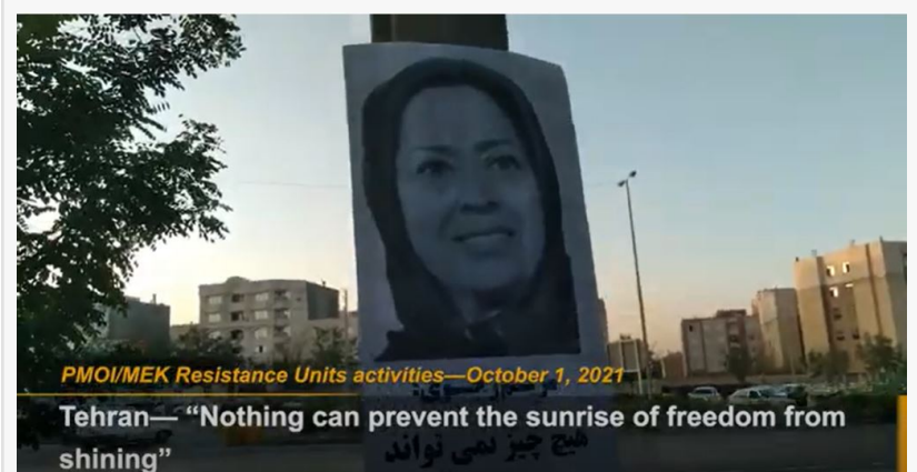
(PMOI / MEK Iran) and (NCRI): Tehran - “Nothing can prevent the sunrise of freedom from shining,”.

“Officials blame rising wages for rising inflation all of the time. On September 21, the state-run Kar-o Kargar daily said, “The 10% wage increase does not comply with the poverty line of 10 million Tomans.” Personal stationery is anticipated to cost over 3 million tomans. Nearly 4 million tomans are given to Iranian laborers. As a result, they should devote the majority of their