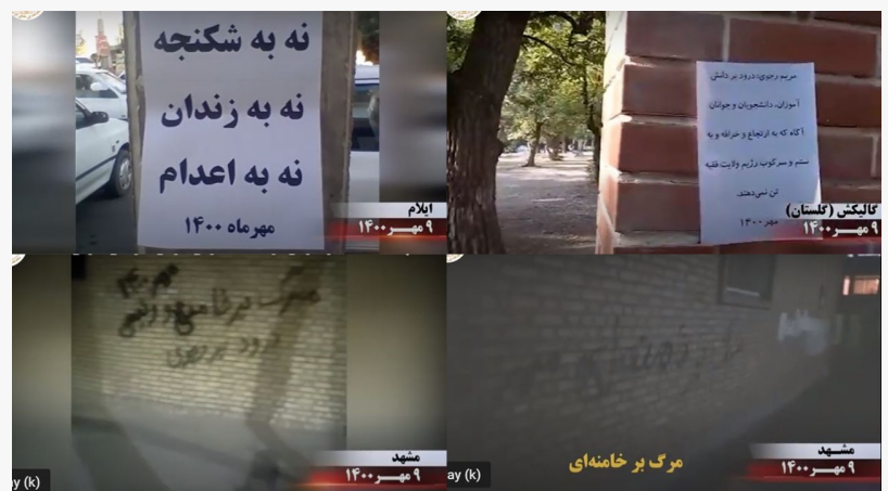
(PMOI / MEK Iran) and (NCRI): Galikesh (Golestan) - "Hail to the defiant students and youths against the suppression of the mullahs' regime". Mashhad - "Down with Khamenei". Mashhad - "Down with Khamenei & Raisi, hail to Rajavi".