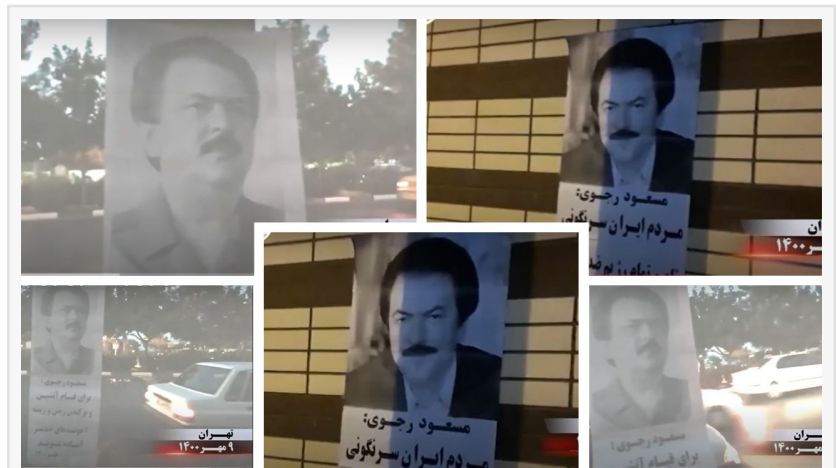
(PMOI / MEK Iran) and (NCRI): Tehran - "Be prepared for a nationwide uprising to overthrow the mullahs". Tehran - "Nothing can prevent the sunrise of freedom from shining".

Tehran— "Be prepared for a nationwide uprising to overthrow the mullahs" Tehran— "Nothing can prevent the sunrise of freedom from shining"