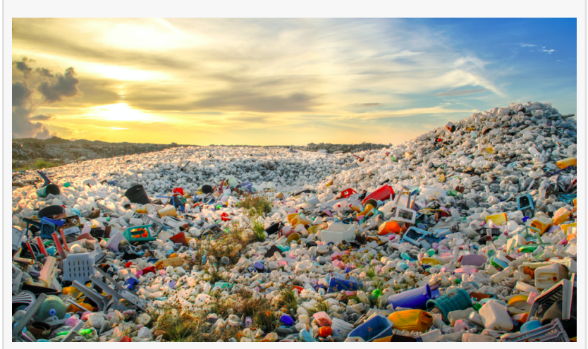
Pile of plastic waste

localized implementation. Through combining existing strengths of both companies, the partnership can efficiently reduce the use of petrochemical raw materials to achieve carbon and plastics reduction. The model conserves resources and maximizes value while retaining use-life. Moreover, projects under the partnership will also address the environmental injustice of today's consumption-disposal patterns through emphasis on responsible consumers and corporations. PANELTECH.US Corp will continue to invest in the development of local skillset, capacity building and job creation for a greener future, leaving no one behind.