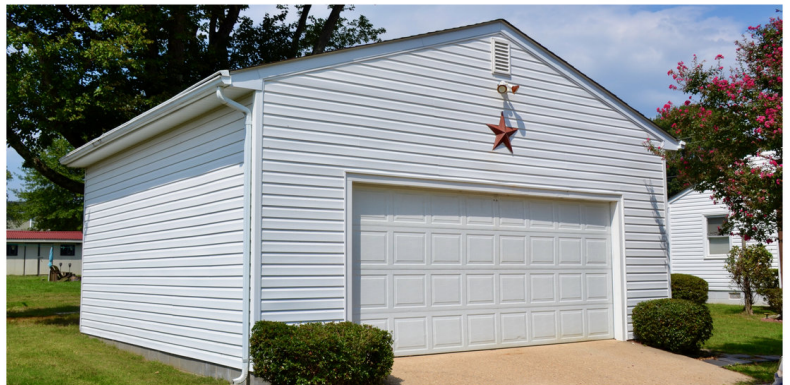
220 Lorraine Ave., Fredericksburg, VA 22408