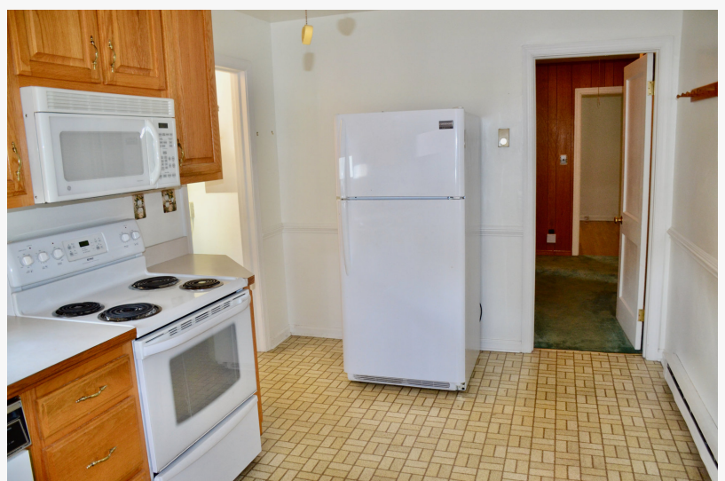
220 Lorraine Ave., Fredericksburg, VA 22408