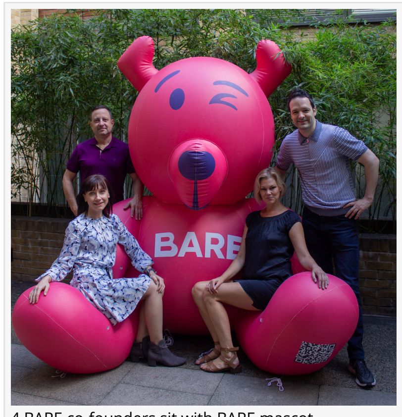
4 BARE co-founders sit with BARE mascot

Wednesday the 6th of October is National Kink Day: an entire day devoted to celebrating consensual sexual activity, kinks, and experimentation. As new research* shows that 31% of British adults are not sexually active, BARE, a new dating app that encourages users to embrace their sexual desires by interacting playfully, is asking the nation to accept, embrace and prioritise their