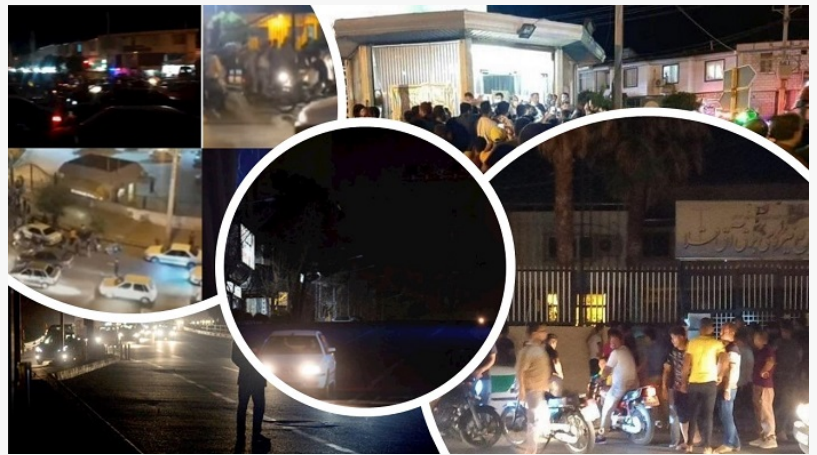
(PMOI / MEK Iran) and (NCRI): Power blackouts trigger protests in many cities.

(PMOI / MEK Iran) and (NCRI): People of Tehran stage protest, chant, "Death to the dictator," and "Khamenei, shame on you, leave our nation alone".