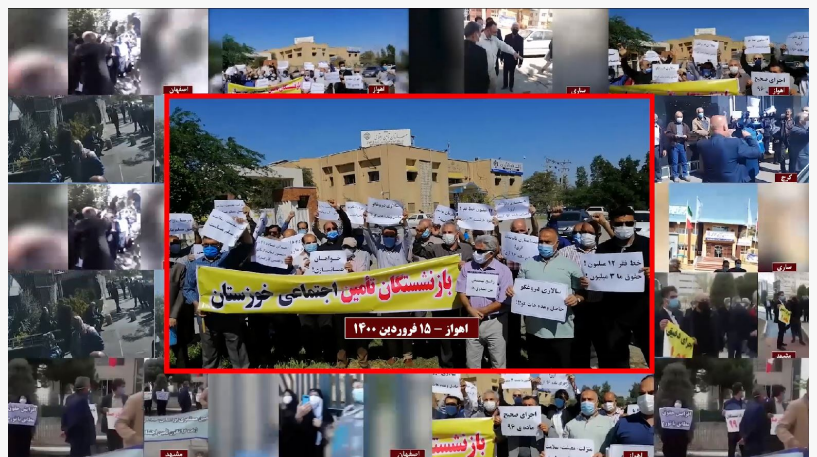
(NCRI) and (PMOI / MEK Iran): Nationwide gathering against the clerical regime: retirees and pensioners protested the poor living conditions, low wages, and high prices.