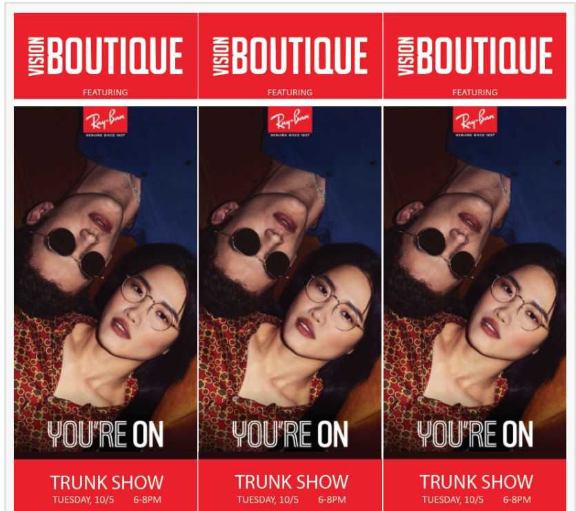
Trunk Show Featuring Ray-Ban at Vision Boutique Madison