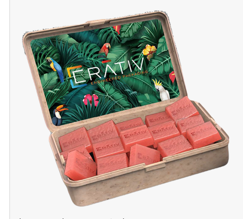
Plant Based Gummy Display

This press release can be viewed online at: https://www.einpresswire.com/article/553131965 EIN Presswire's priority is source transparency. We do not allow opaque clients, and our editors try to be careful about weeding out false and misleading content. As a user, if you see something