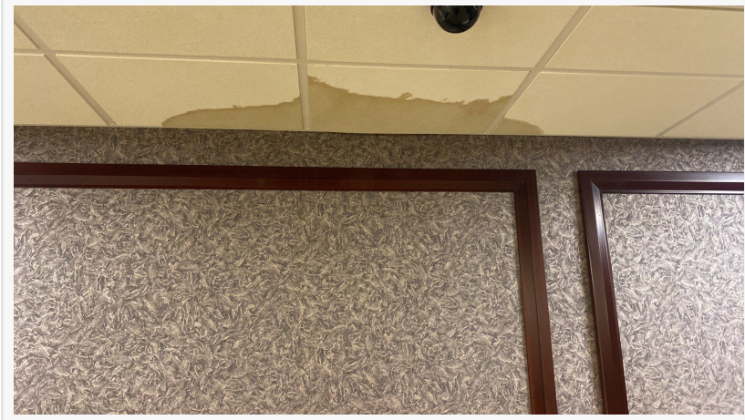
Visible water damage in ceiling tiles.