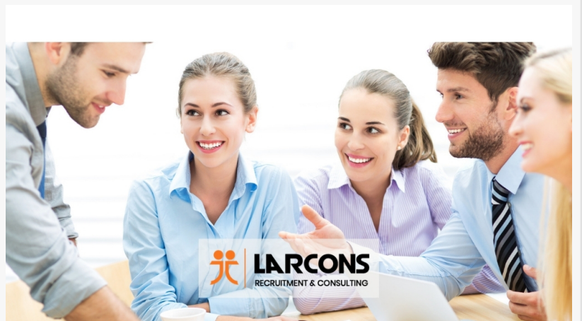
Larcons-Orlando Office Image cover