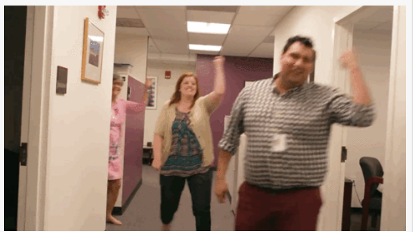
Larcons-New Orlando Office Recruitment Giveaway Gif

This giveaway will take place on October 15h, 2021 at 5:00 PM. A Larcons group of recruitment specialists will select the winner based on a couple of different factors and will contact the business directly the next business day. To apply, please visit the following link: