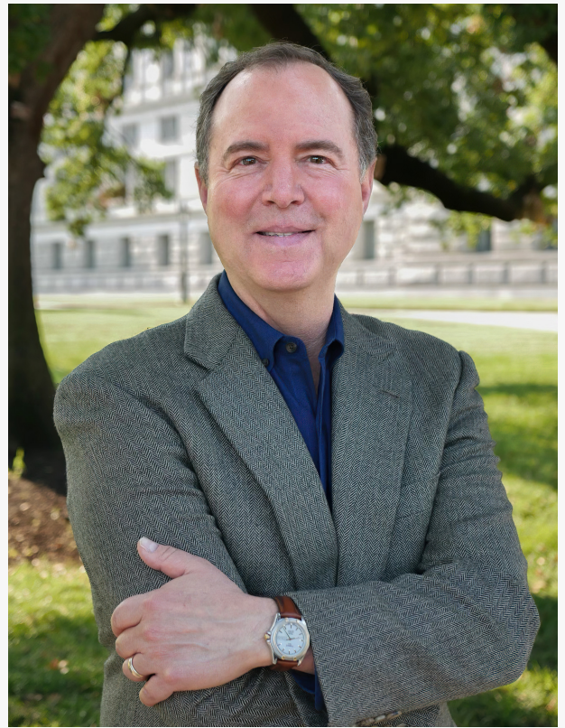
US Representative Adam Schiff chronicles democracy's darkest hours in "Midnight in Washington" in a conversation with Larry Wilmore.