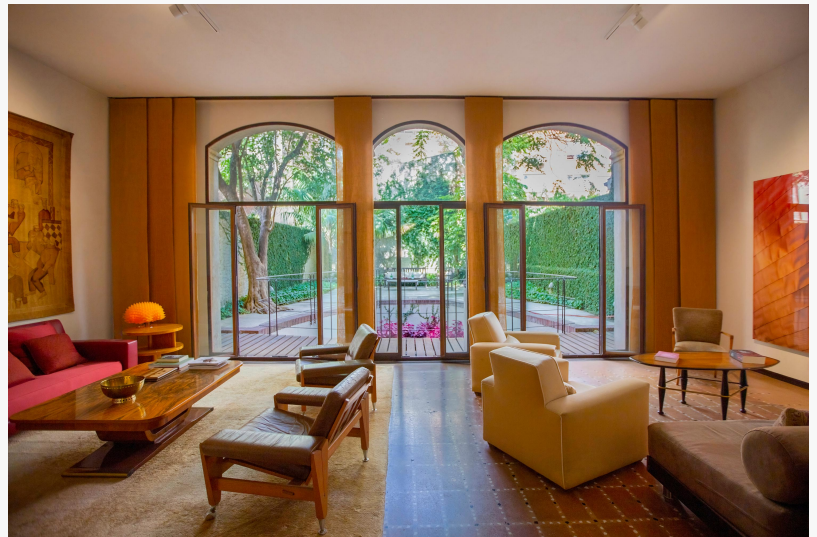
Barcelona Mews House, 12 Passatge de Sant Felip, Barcelona, Spain

NEW YORK, NEW YORK, UNITED STATES, October 7, 2021 /EINPresswire.com/ -- A secret oasis in Barcelona, this Barcelona mews house will auction next month via Concierge Auctions in cooperation with listing agent Salvador Font of Font Real Estate. Currently listed for €3.95 million, the property will sell No Reserve to the highest bidder, regardless of price. Bidding is scheduled to be held on 16-19 November, via the firm's digital marketplace, ConciergeAuctions.com , allowing buyers to bid remotely from anywhere in the world.