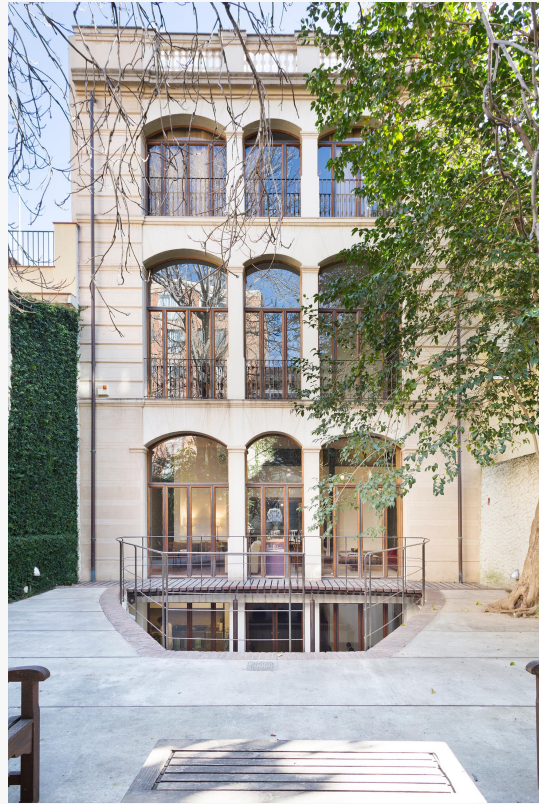
Four-storey townhouse with Tobia Scarpa modernism interior and original façades

Set between the Barcelona coast, Montjuïc (home of the 1992 Olympics) and the majestic Serra de Collserola Natural Park (22 times larger than New York's Central Park), El Putget i Farró, a tranquil, stylish neighborhood of the Sarrià-Sant Gervasi district, the second largest neighborhood of Barcelona. With minimal traffic, the small-town European atmosphere lends itself to experiencing Barcelona unhurried. New and old attractions encapsulate the historic yet modern section of the city, with the basilica La Sagrada Família equidistant to experiences like Barcelona's contemporary art museum. Alongside impeccable architecture lay rolling hills, verdant public parks and gardens. Long beaches of golden sand and blue waters line the coast. The graceful Collserola mountains offer 8,000 hectares to be explored. Cycle, birdwatch, and hike through lush Mediterranean flora overlooking Catalonia and the Balearic Sea. El Putget i Farró is idyllic, calling to anyone looking for the perks of city living, but where solitude and serenity are only one step away.