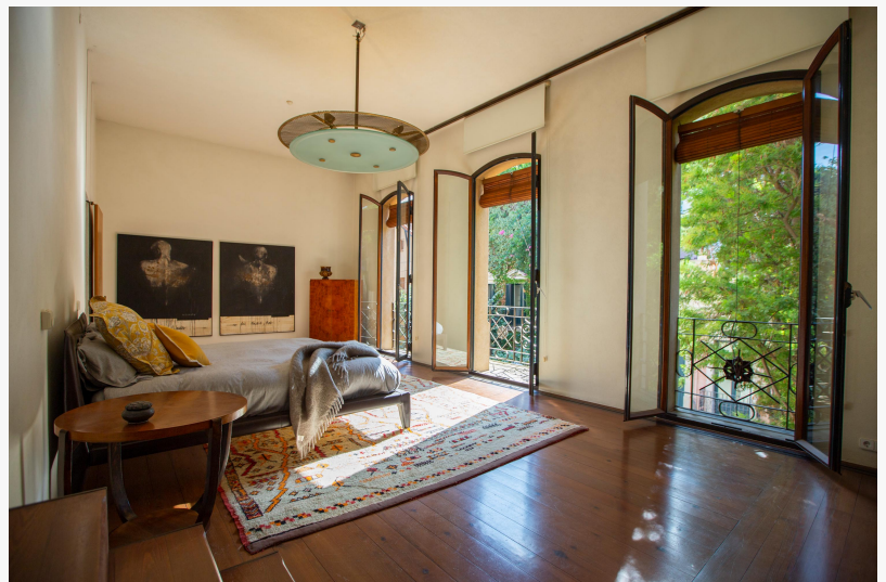
High ceilings and tall windows invite bright natural light