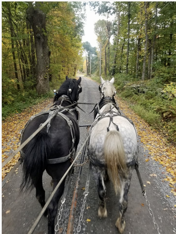
Recent trip via horse-drawn wagon down a path at the Ranch

This press release can be viewed online at: https://www.einpresswire.com/article/553303556