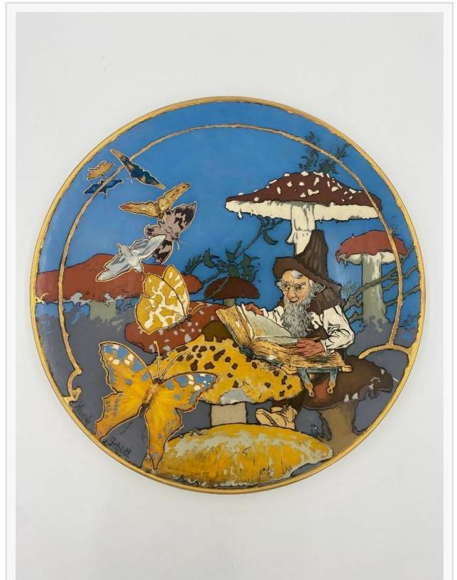
Beautiful Mettlach stoneware charger by Heinrich Schlitt, 17 ½ inches in diameter, the large circular form depicting a scholarly gnome reading a book in a toadstool forest, signed ($3,321).

This press release can be viewed online at: https://www.einpresswire.com/article/553317385