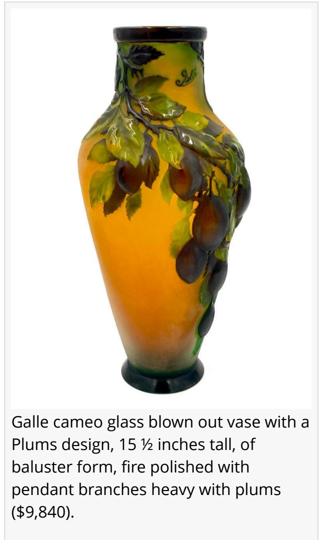
Galle cameo glass blown out vase with a Plums design, 15 ½ inches tall, of baluster form, fire polished with pendant branches heavy with plums ($9,840).

Fans and collectors of silver had much to consider, including a Gorham Buttercup sterling flatware service that brought $2,214; a Towle sterling flatware service in the King Richard pattern in a fitted felt-lined case, weighing 90.66511 oz. troy ($1,722); and several pieces of Old English