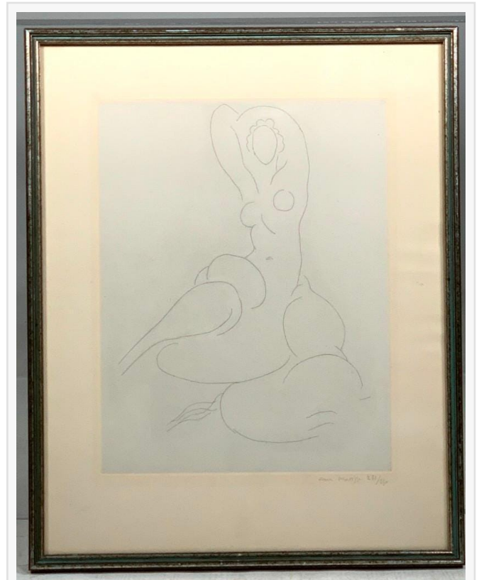
Etching on chine colle by Henri Matisse (French, 1869-1954), titled Nu Pour Cleveland (1932), signed and numbered ("231/250") ($4,612).