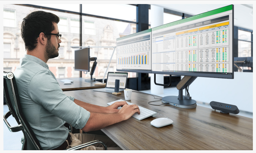
The Infinite Designer is also a specification tool that ensures the most appropriate Workspace Technology worktools for computer use, including Integrated Docking, which eliminates all desktop cables and provides a pristine, uncluttered workspace to optimize performance

Zgo Technologies, originating in Australia in 2010, is a designer and manufacturer of high-performance ergonomic products with a primary focus on Workspace Technologies, the design discipline that concentrates on the most effective use of technology in the officeplace. Headquartered in Atlanta, GA, and with facilities around the globe, Zgo Technologies makes the use of today's technology more efficient, more effective, and more comfortable, which greatly improves