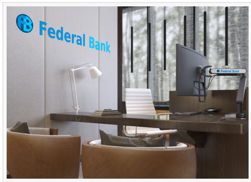
The Infinite Designer can be used to promote your company brand internally for employees or externally for customers

Though functionally essential, many design professionals believe monitor arms detract from the aesthetics of the station; steel contraptions that jut up from the desk and dominate the office appearance. Today, corporate design is much about internal brand promotion, connecting employees to the company's identity, culture, and external messaging to establish brand