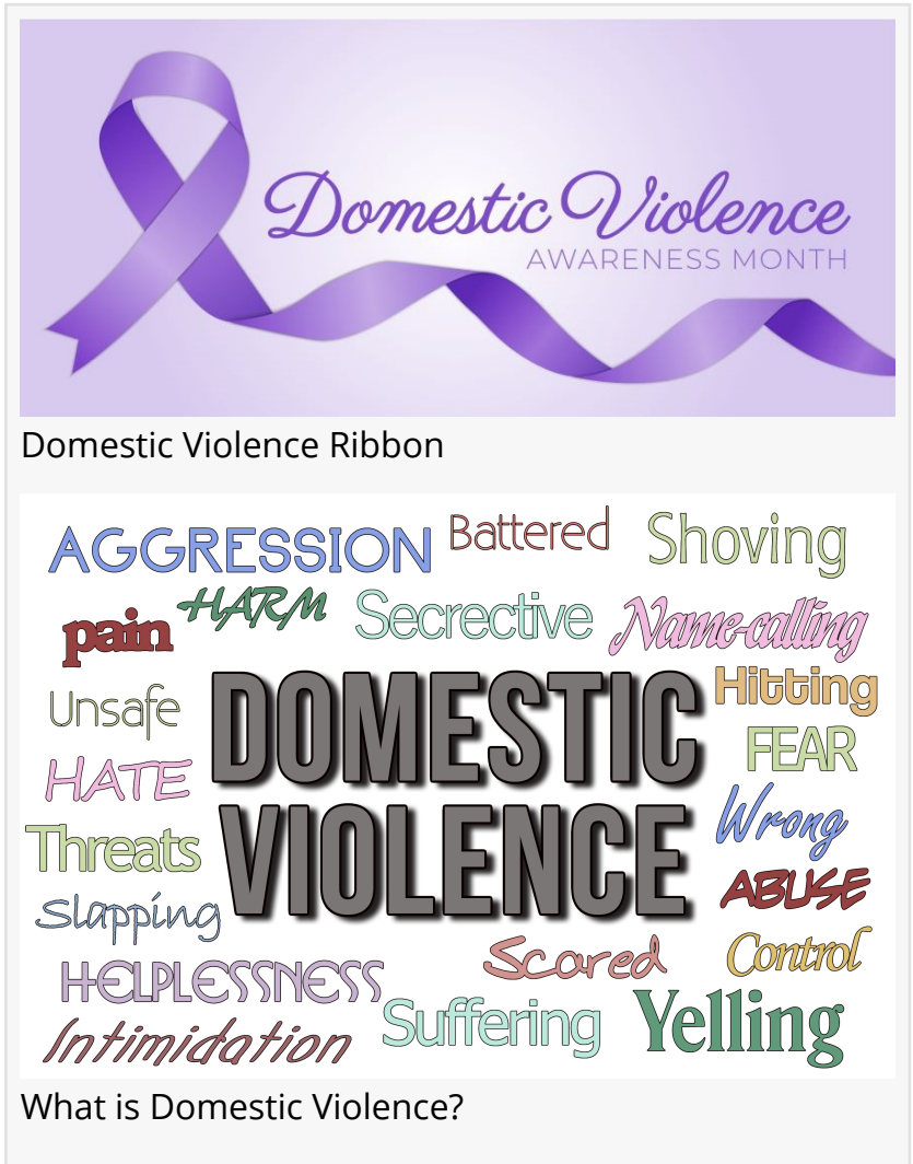
Domestic Violence Ribbon

As per a Press Release submitted by the Department of Justice, Office of Public Affairs out just a