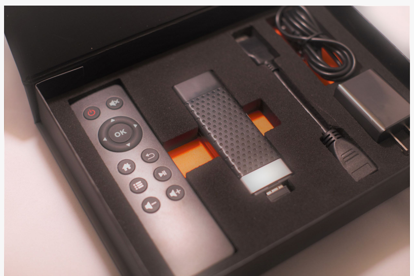
MORF your TV into your personal fine art gallery with the MORF Gallery ArtStick™

Several of the artists will be selling their work using a proprietary industry-first ArtStick™, developed by MORF Gallery, that transforms any TV into a mind-expanding fine art gallery that