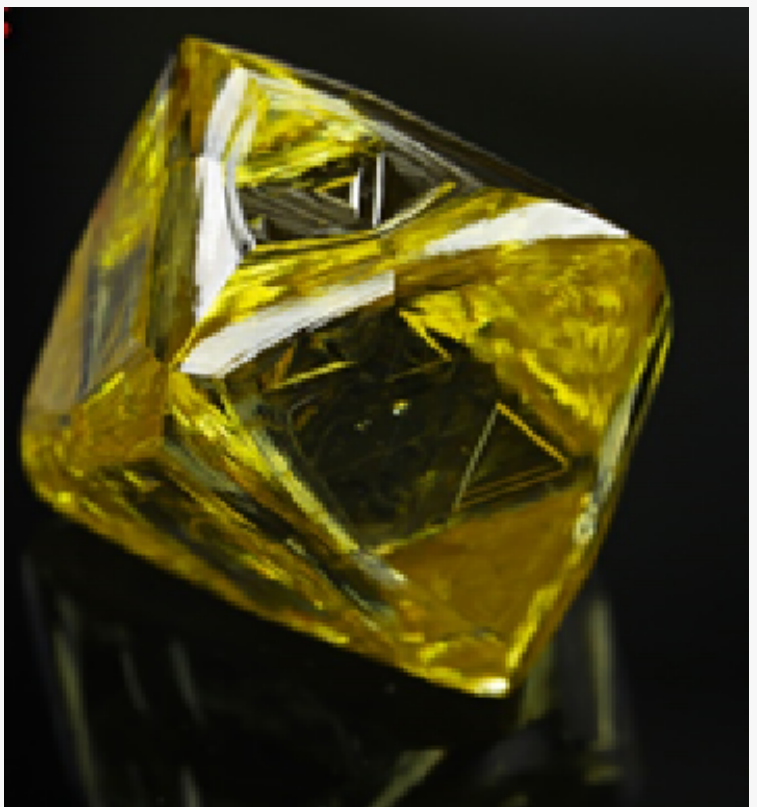
28 Carat Rough Vivid Yellow Zimi

When deciding to buy Zimi or other fancy diamonds, always work with a trusted specialist known for expertise in colored diamonds. There are few dealers like Premier Diamond Group fortunate enough to have relatively steady access to Zimi Yellow diamonds.