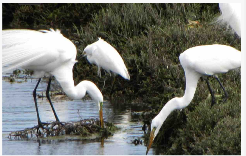
Great Egrets at LA's Ballona Wetlands