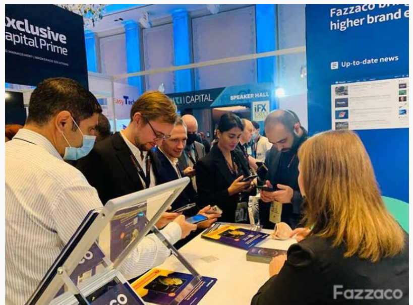
Fazzaco booth crowded with attendees

This press release can be viewed online at: https://www.einpresswire.com/article/553370557