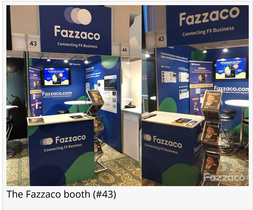
The Fazzaco booth (#43)

Though the prizes we prepared in advance were stolen a day prior to the event, we managed to run the raffle as planned, which is a demonstration of how resilient and capable our team is. Huge thanks to our friends in Cyprus for their help.