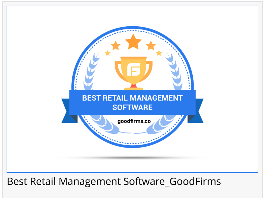
Best Retail Management Software_GoodFirms

business is the process of purchasing goods from a manufacturer or a wholesaler and selling these goods to people. It involves numerous internal processes such as inventory management, warehouse operations, offline and online storefronts, payments, accounting, human resources, and much more.