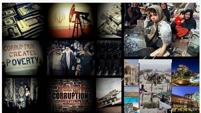
(NCRI) and (PMOI / MEK Iran): Corruption and plundering is a Major Cause of Poverty.