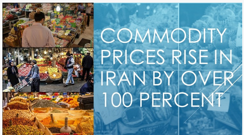
(NCRI) and (PMOI / MEK Iran): Commodity Prices Rise: the goods have risen in price by over 100 percent in Iran in the last 12 months.