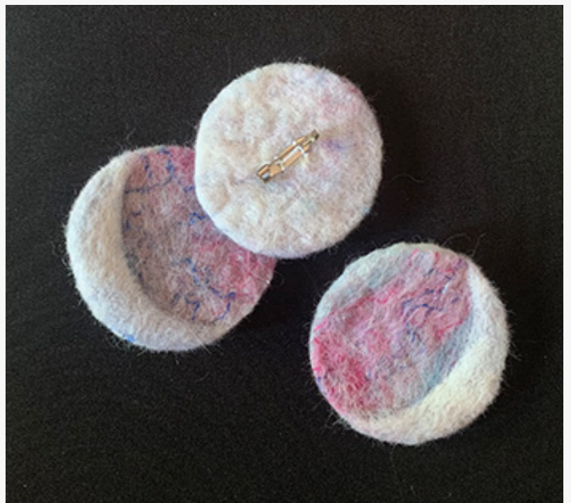
Beautifully handmade moon brooches