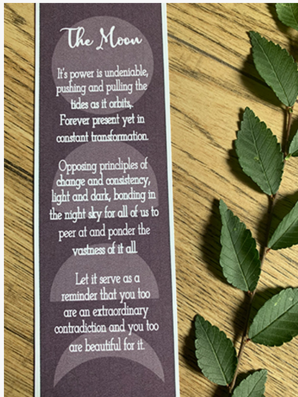
All Ruby Bloome Gifts are accompanied by a bookmark fitting the theme of each collection.