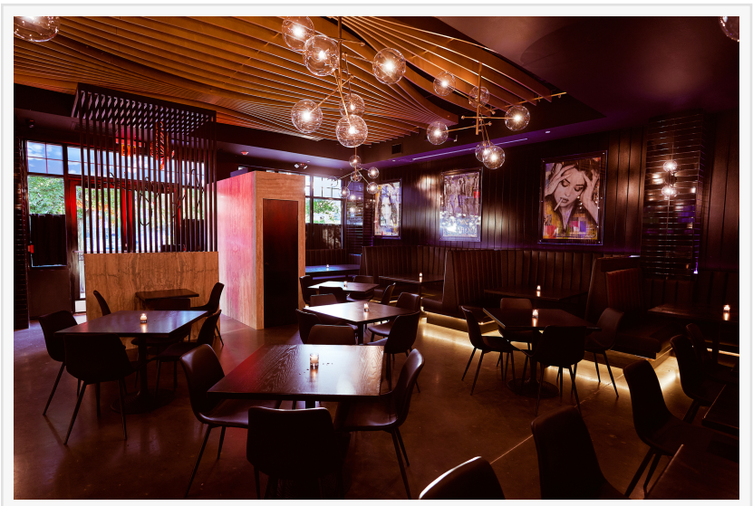
Nunzi's Dining Room

"Here at Nunzis we plan on keeping my grandfather's traditions alive. You will