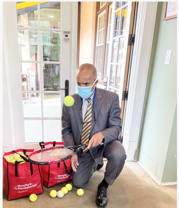
West Side Tennis Club fills up Mooney's bag with balls for Operation Arthur Ashe Tour.