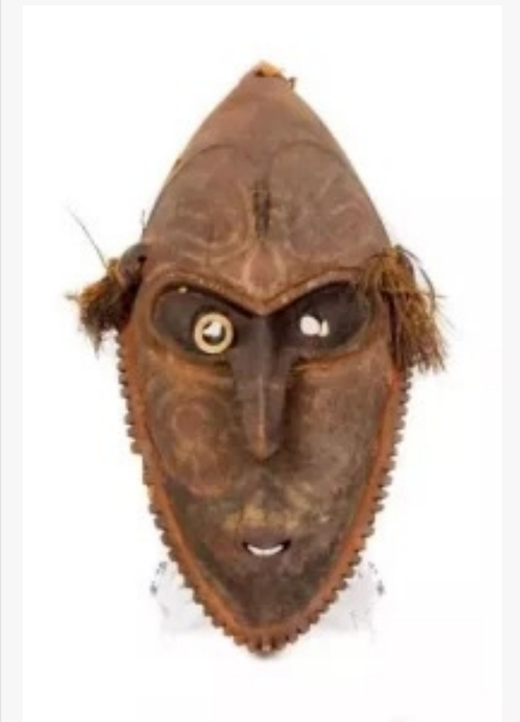
Lower Sepik River Mask, H18" x W8"