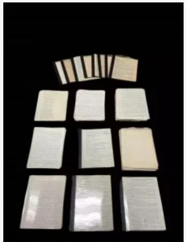
Ledoux Manuscript, Field Diary, and Notes