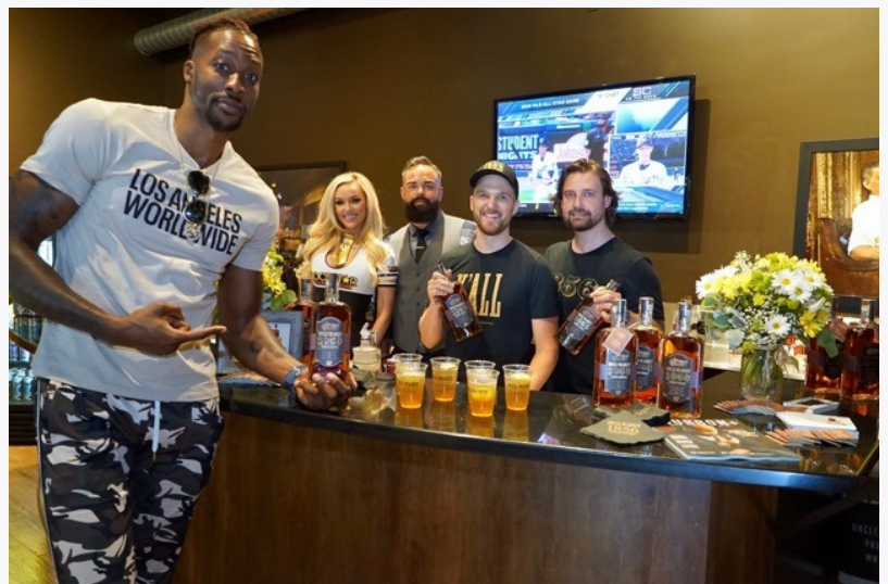
Lakers Star Dwight Howard being gifted at Luxury Experience & Co Gifting Lounge