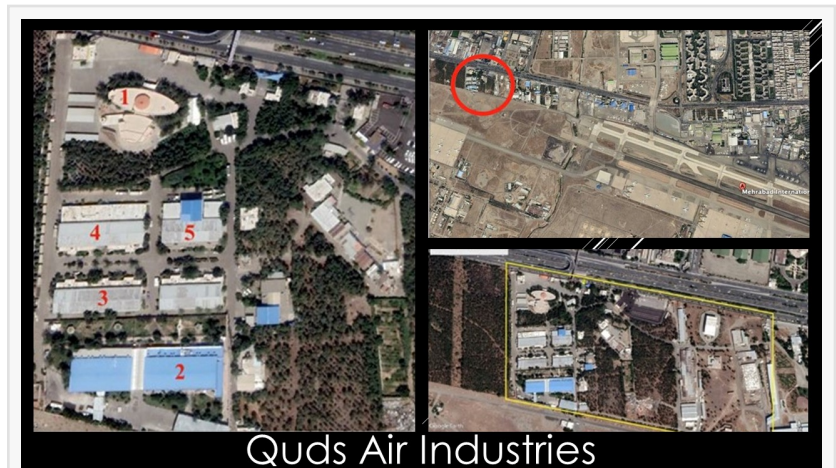
Quds Air Industries

The regime's drone program represents a growing threat both to global security and to a domestic population that is suffering from an 80 percent poverty rate and a coronavirus epidemic that remains almost entirely out of control. Yet, the world community is maintaining too soft a stance in the face of such threats, while it should sever all diplomatic and economic ties with the Iranian regime pending serious conciliatory gestures from the regime.