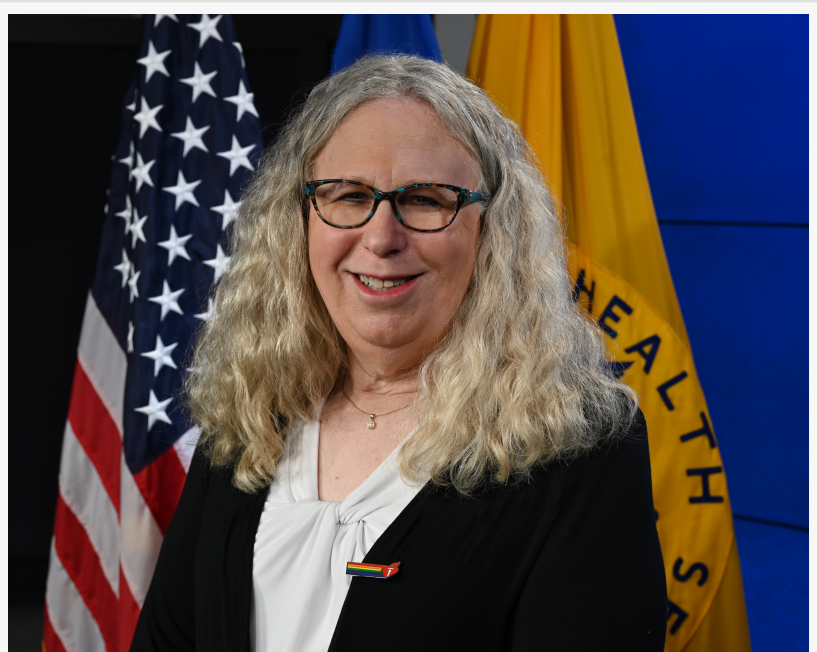
Assistant Secretary of Health Rachel L. Levine, M.D. to receive Esperanza (Hope) Award