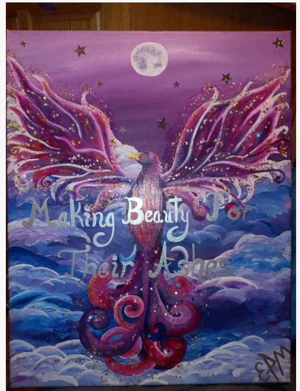
The Phoenix gets his beauty from his ashes

Any purchase made at the store will give 85% to an