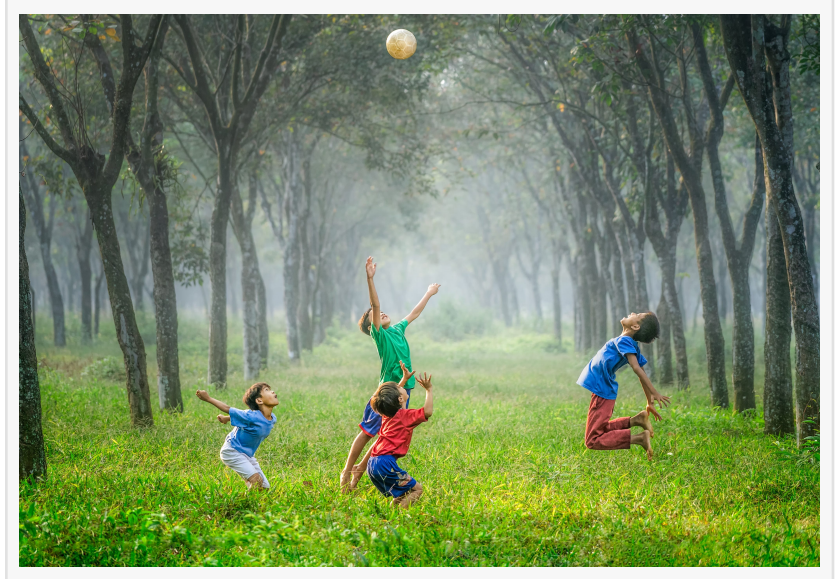
Approximately 6.1 million children are using psychiatric drugs, and almost half of them are on drugs due to being labeled with Attention Deficit Hyperactivity Disorder (ADHD).

done despite the known risks? Because a psychiatrist prescribing drugs can make up to four