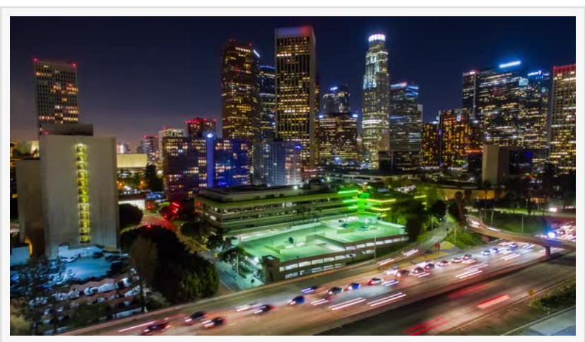
Benjamin, Chaise & Associates

WEST HILLS, CALIFORNIA, UNITED STATES, October 13, 2021 /EINPresswire.com/ -- Many businesses get stuck in a challenging situation because of non-payers. Troublesome debtors don't only lead to financial problems, but also raise questions about the company's credibility. So, it is wise to avoid any unwanted situations caused by debtors by taking the right move. When you find your debtors ignore you or avoid your calls on purpose, their intentions are clear. If you face this situation, it is wise to make the best decisions after studying the problem and not make a hasty move. Here we have explained why you need to hire the best debt collection agency in such situations.