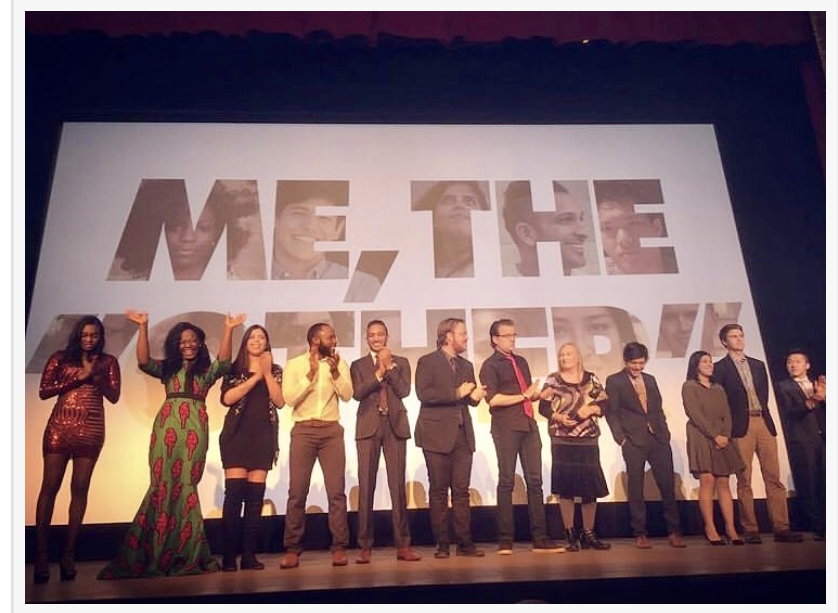
MTO World Premiere at Michigan Theater

For more about the film, educational viewings and streaming options, please visit metheotherfilm.com