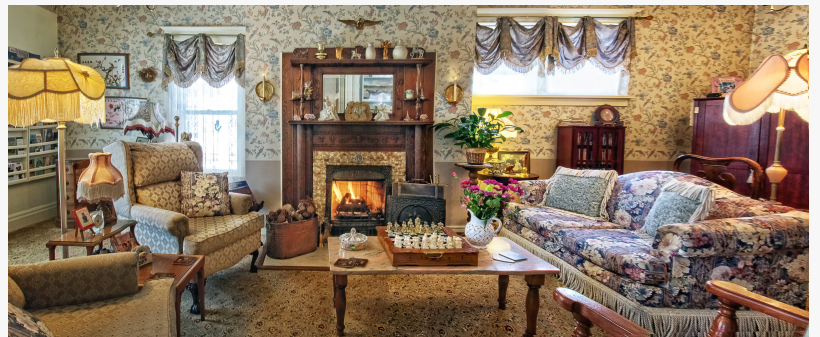
The fall season is a great time to enjoy the living room fireplace

In addition to these discount specials, Holden House also offers add-on packages such as the breakfast en-suite Romance Package, Sparkling Package, Ducky Bubbles and Breakfast and Massage For Two. The inn also has online gift shop items that can be pre-ordered prior to your stay that includes cookbooks, signature Holden House teddy bears, embossed wine glasses, aprons and more. Details on packages can be found on the inn's website at www.HoldenHouse.com or by calling 719-471-3980.