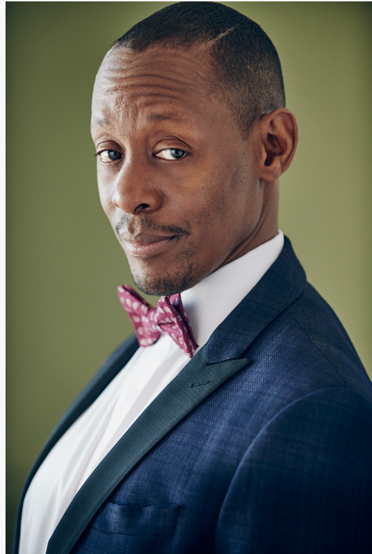
Actor Terrence Clowe

For more about TERRENCE CLOWE visit: TerrenceClowe.com