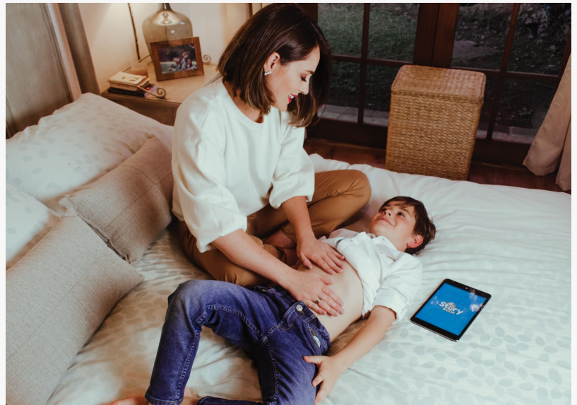
Storybook App helps parents make their kids wind down and sleep better

MIAMI, FL, USA, October 13, 2021 /EINPresswire.com/ -- Over a million children from ages zero to twelve and their parents have experienced the benefits of Storybook App . This specially designed app is the world's only software app to combine infant massage techniques and bedtime storytelling to help children fall to sleep.